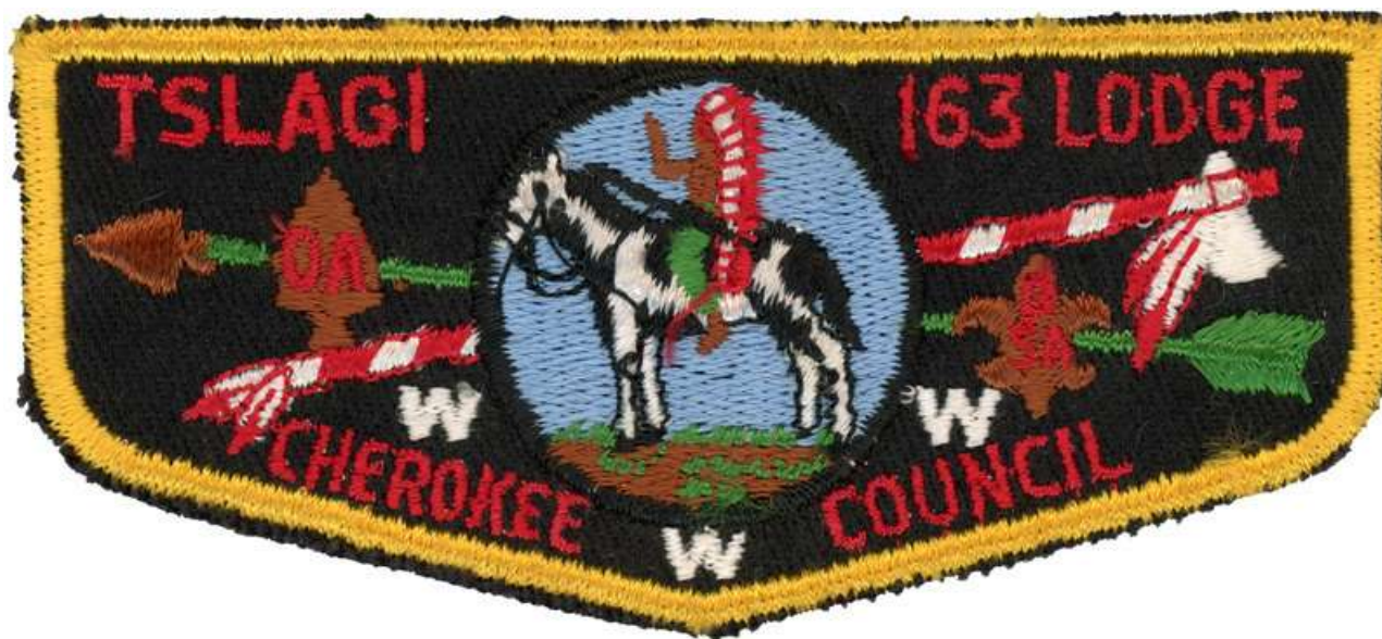
Tslagi F1 1958