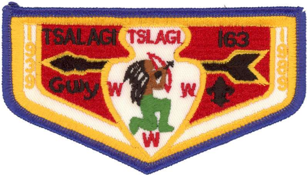
Tsalagi F2 1988