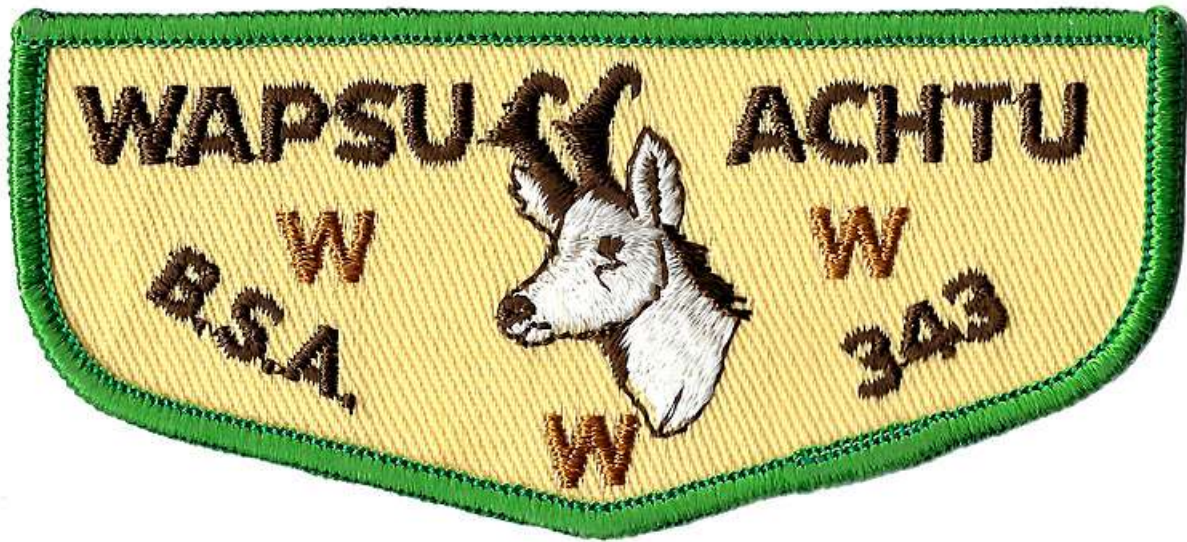
Wapsu Achtu F1