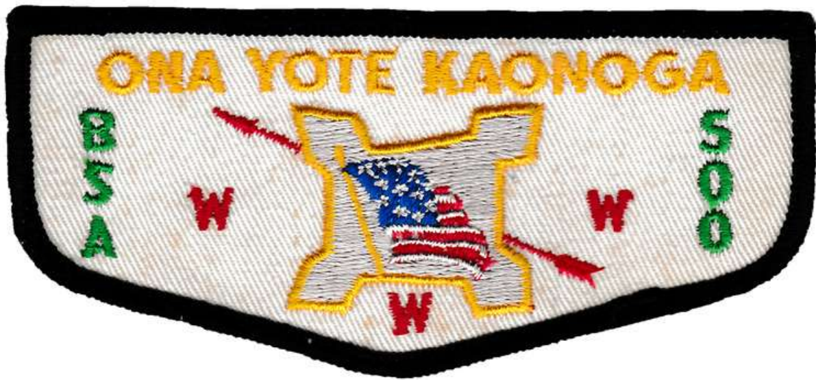
Ona Yote Kaonaga F1