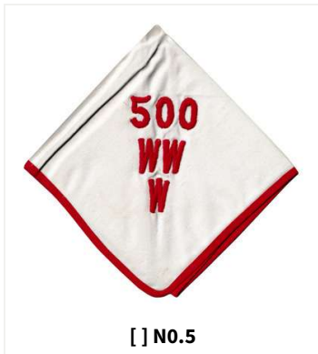
[ ] N0.5

N: NECKERCHIEFS: SILKSCREEN, EMBROIDERED, OR WITH PATCHES