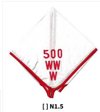
[ ] N1.5