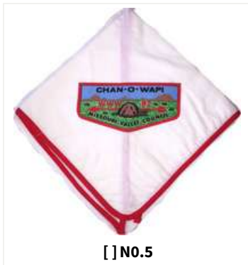
[ ] N0.5

N: NECKERCHIEFS: SILKSCREEN, EMBROIDERED, OR WITH PATCHES