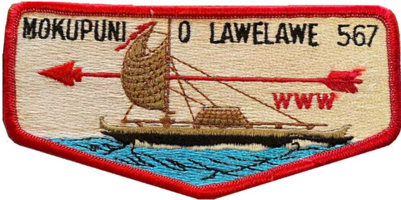
Mokupuni O Lawelawe S1a