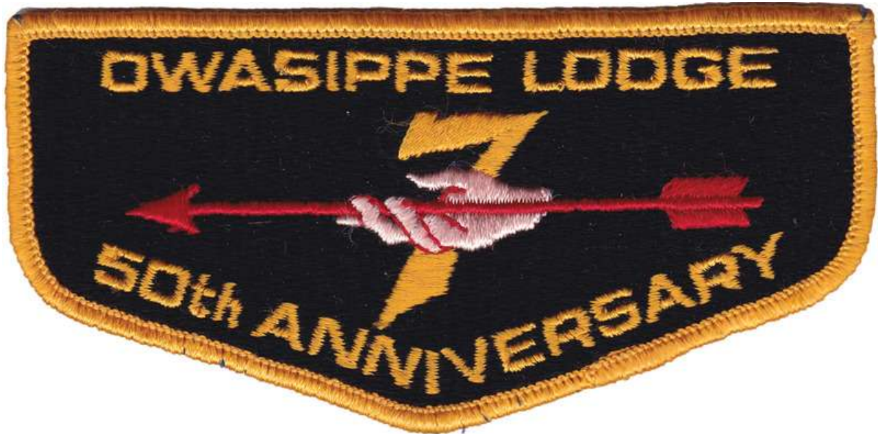
Owasippe S1 1971