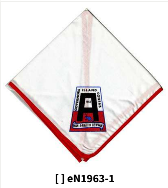
[ ] eN1963-1