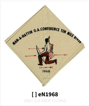
[ ] eN1968 1968 | (OA BBV6: EN1968)