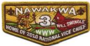
3B Nawakwa S115