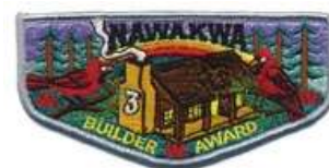
3B Nawakwa S43