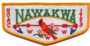
3B Nawakwa S18