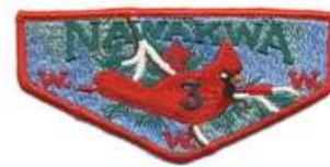
3B Nawakwa S24