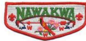
3B Nawakwa S16a