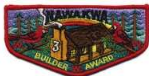
3B Nawakwa S38b