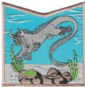
440B Erielhonon X2