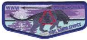
440B Erielhonan S3 2018 | OA BBV6: