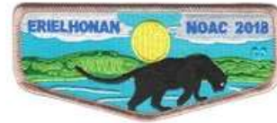
440B Erielhonan S4 2018 | OA BBV6: