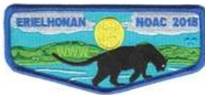
440B Erielhonan S5 2018 | OA BBV6: