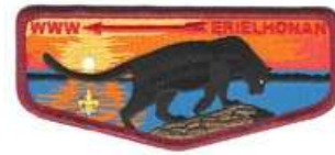
440B Erielhonan S2 2017 | OA BBV6: