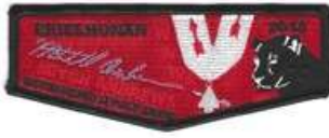
440B Erielhonon S7