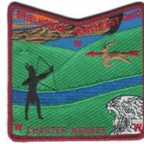
440B Erielhonon X1