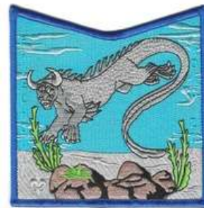
440B Erielhonon X3