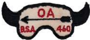
460A Iyatonka X1